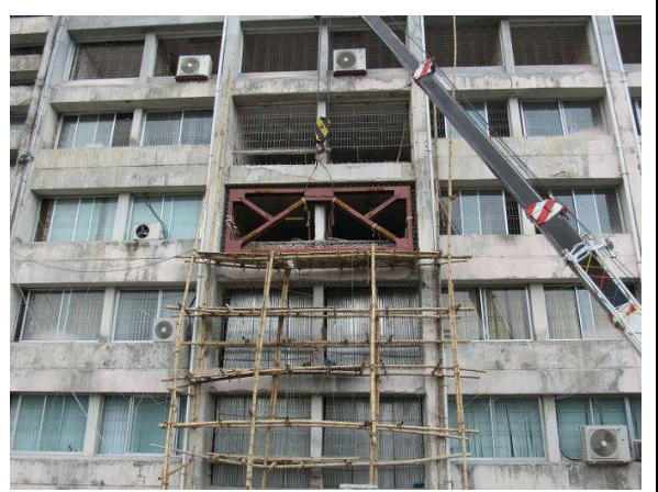
Installation of brace at high levels